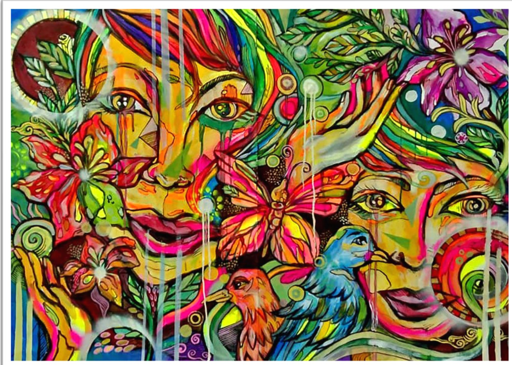
age category, >=18Y, Celebration of Love and Camaraderie