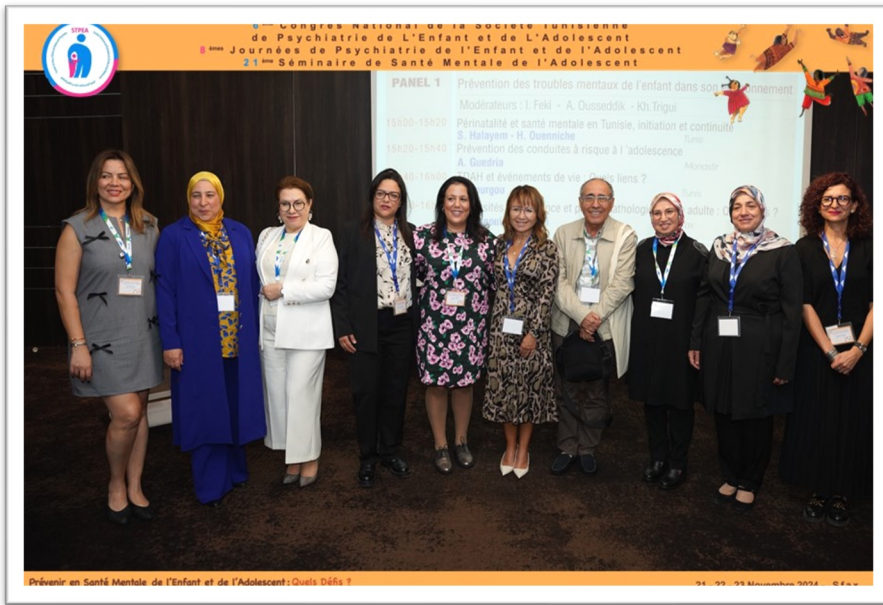
Figure 1: The 6th Congress of the Tunisian Society of Child and Adolescent Psychiatry, November 21-23 2024, Sfax, Tunisia.

Tunisia. This guide aims to strengthen the implementation of evidence-based clinical practices while tailoring them to the local context. It is expected to be finalized in the first half of 2025.